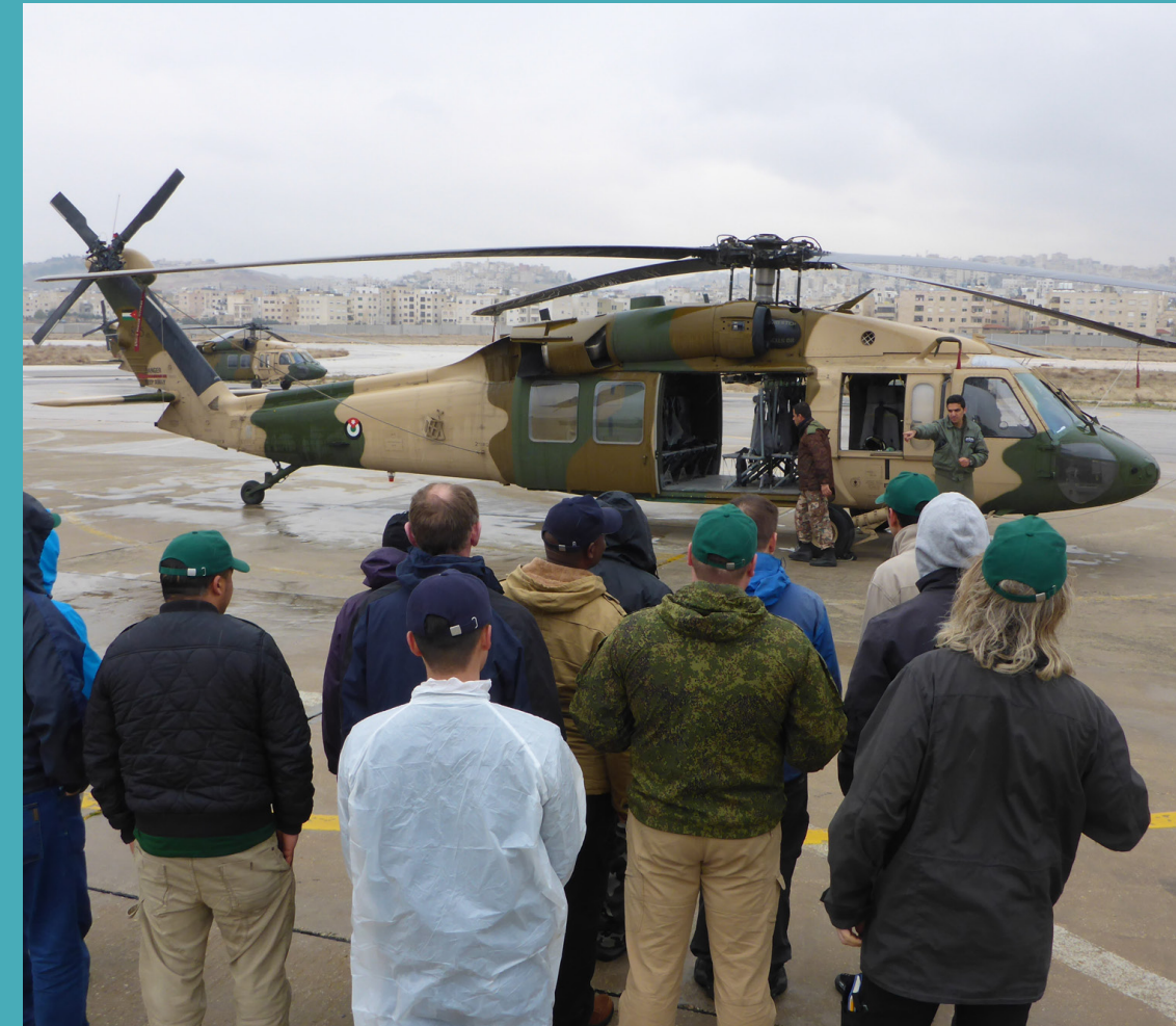
The helicopter used for overflight as the team searches for evidence of nuclear testing during Integrated Field Exercise 2014 (IFE14) in Jordan