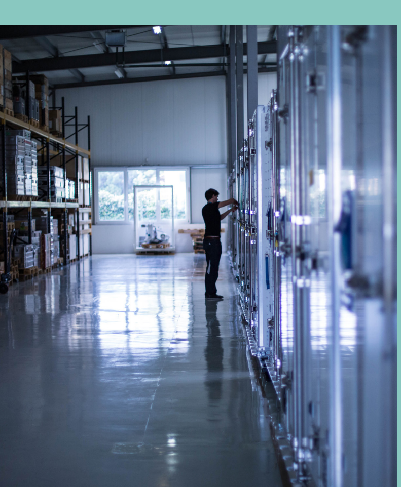
OSI Equipment at CTBTO's storage facility located near Vienna

Deploying the inspection team into the field is extremely time critical because there is a narrow window during which some of the conclusive evidence for a Treaty violation can be obtained. The occurrence of seismic aftershocks after an event, for instance, declines with every passing day. Equally, specific radioactive elements, i.e. particulates and noble gases, dissipate quickly due to their relatively short half-lives.